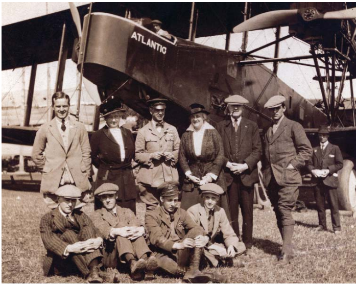
Handley Page VI1500, F7140, Atlantic, entered for the attempted 1919 transatlantic crossing.