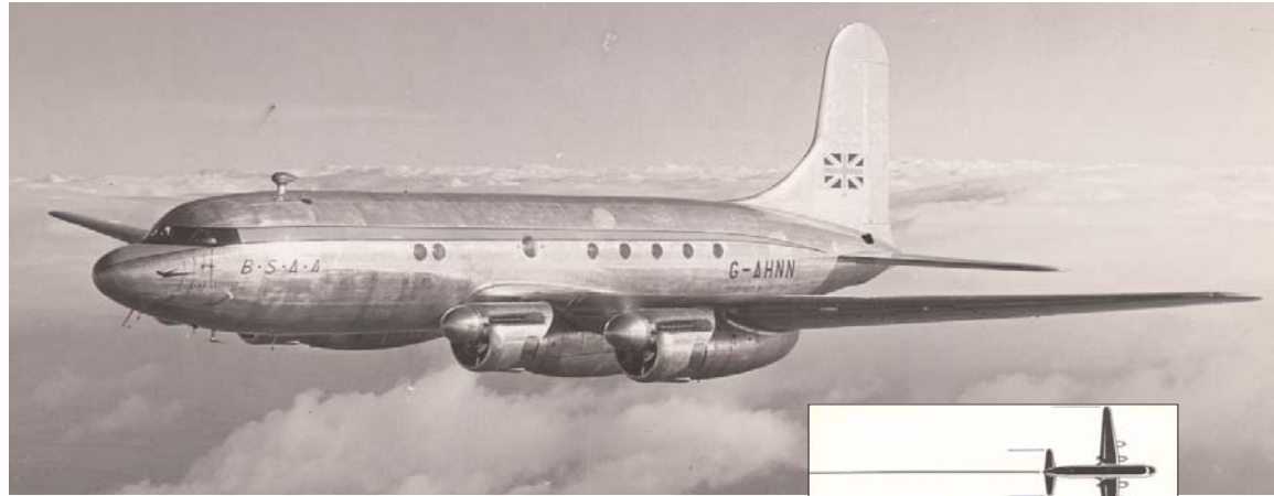
Avro Tudor 4, G-AHNN, Star Leopard, of BSAA.

(A&AEE) at Martlesham Heath between 1928 and 1934.