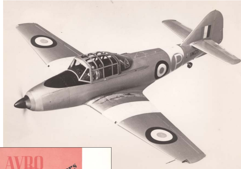
The Armstrong Siddeley Mamba-powered Avro Athena T1, VM125.

Fairey Firefly T7/AS7. R.C.B. Ashworth. 1981. 23pp.